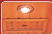
Ventilation; Reading Light